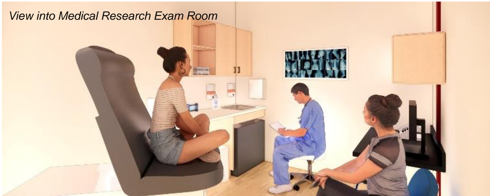
View into Medical Research Exam Room